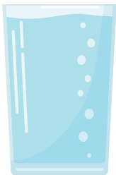
take a drink