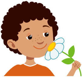
take deep breaths